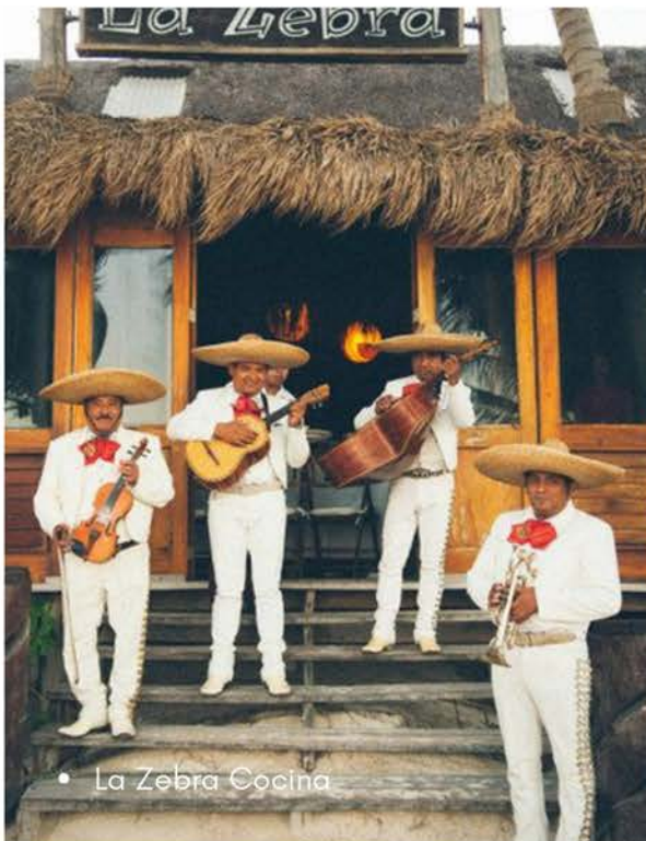
• La Zebra Cocina