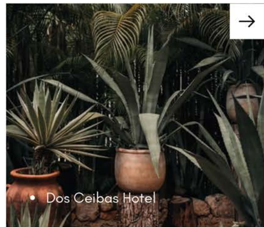
• Dos Ceibas Hotel

THE EPICENTER OF EXCLUSIVE TRAVEL AND TRANSFORMATIONAL EXPERIENCES