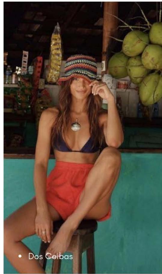
• Dos Ceibas

The hotel's beach bar serves as the perfect spot to unwind, offering an array of handcrafted cocktails and Signature drinks feature local ingredients like tropical fruits and herbs, making each sip a reflection of the region's bounty. For those seeking a health boost, the menu also includes a range of freshly blended smoothies and cold-pressed juices, designed to energize and refresh. Whether dining by the beach or under the stars, the culinary experience at Hotel Dos Ceibas is as nourishing for the soul as it is for the palate.