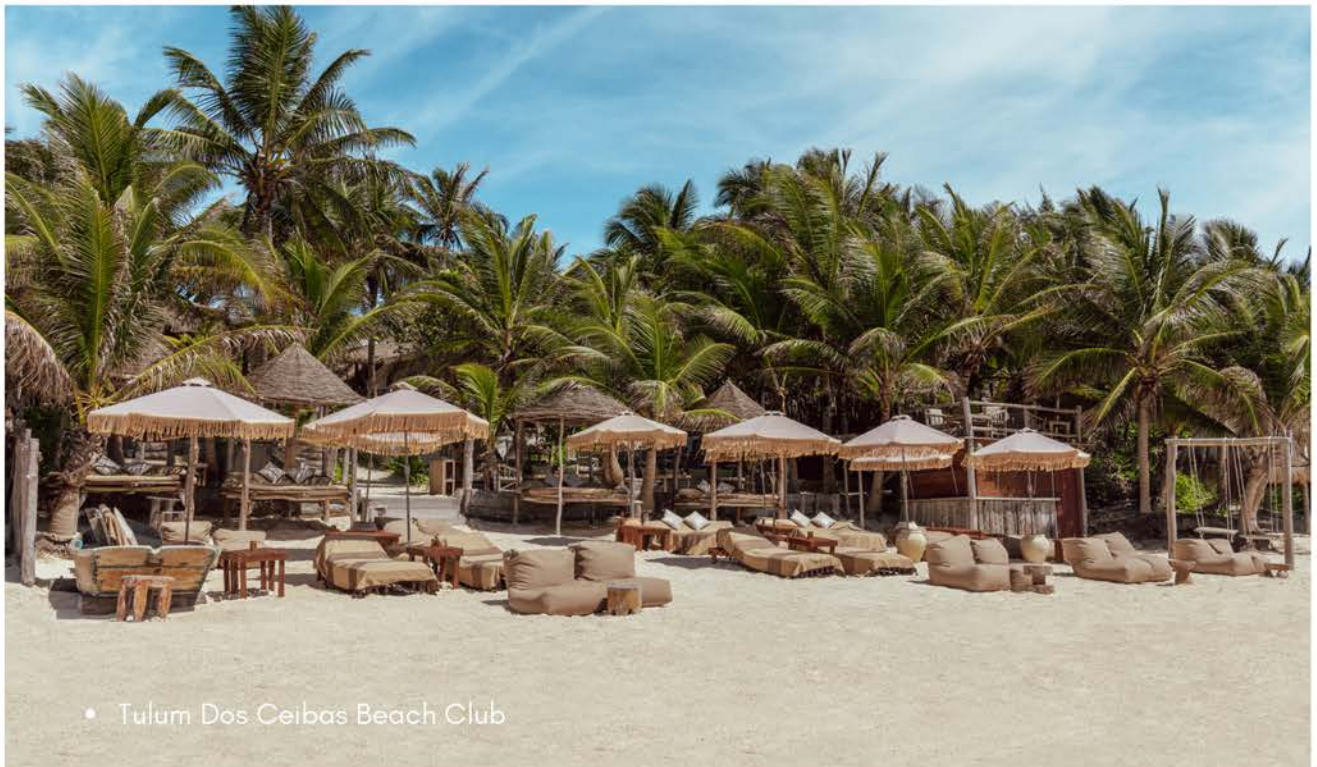
• Tulum Dos Ceibas Beach Club

For those seeking relaxation and rejuvenation, the hotel's holistic center provides a variety of wellness services facilitated by skilled regional professionals. Daily morning yoga sessions are held in tranquil settings, promoting mindfulness and inner peace.