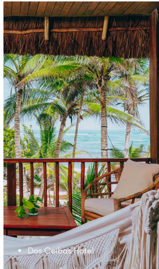
• Dos Ceibas Hotel

Welcome to a place where every moment is infused with purpose. Welcome to Tulum.